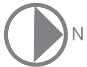
Floor plans are not to scale