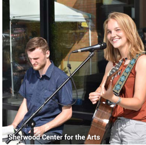
Sherwood Center for the Arts

Surrounded by rolling farmland and dotted with dog parks and community gardens, Sherwood is one of the most desirable locations in the Portland metro area.