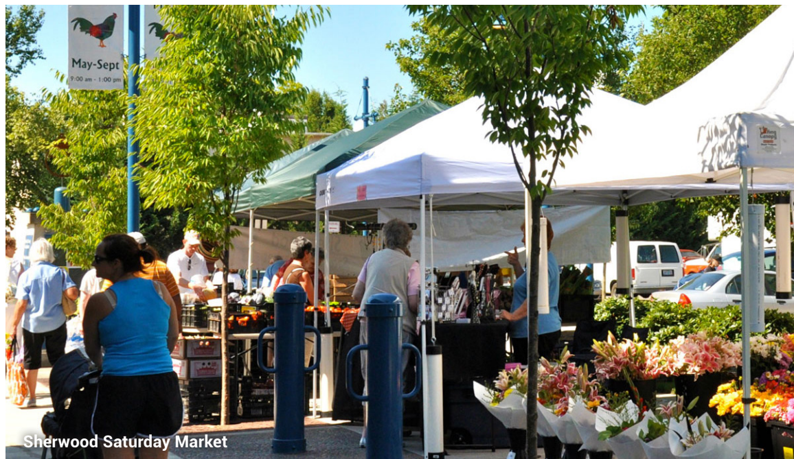
Sherwood Saturday Market