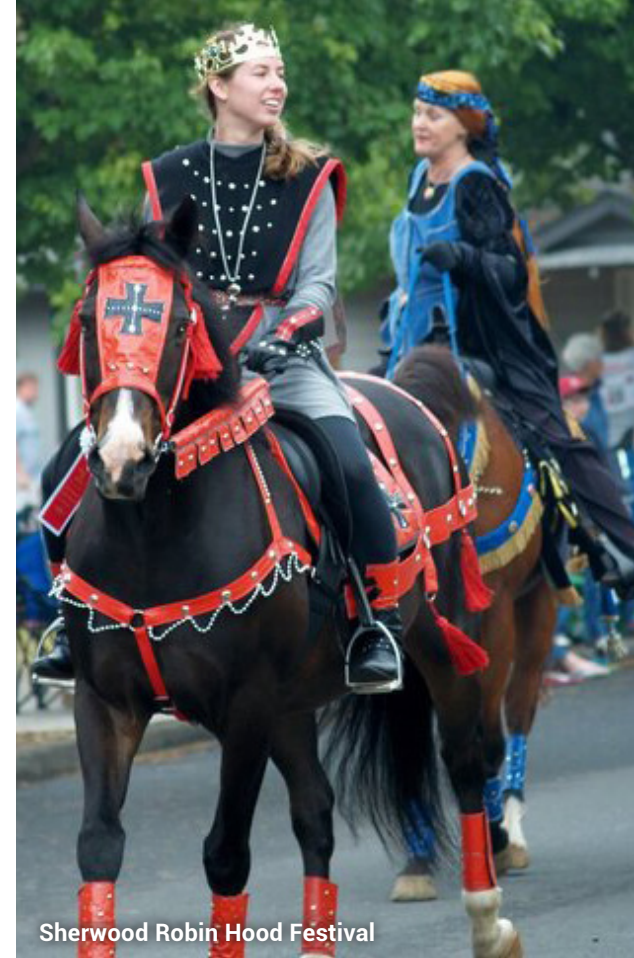
Sherwood Robin Hood Festival